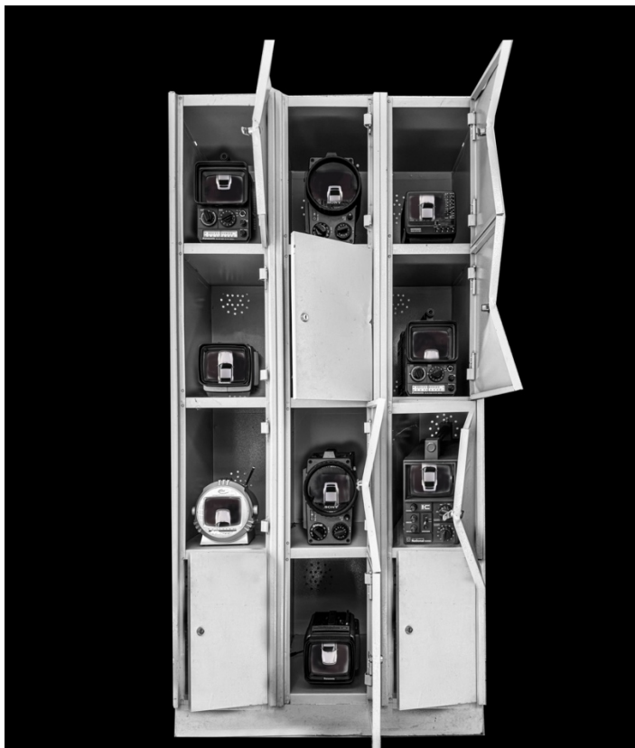
RatAess, 9 von 11, photo RatAess