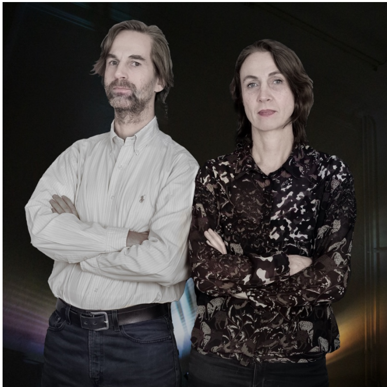
mutual loop